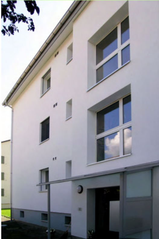
New entrance roof without heat bridges