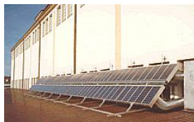
Un glazed module (Grammer)