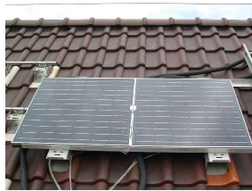
Un glazed module (ECN)