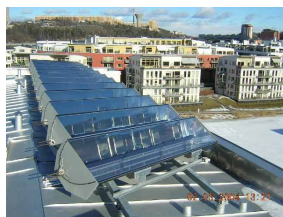
Stationary module (Lund, Priono AB)