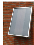
Glazed module (Aidt Miljø)