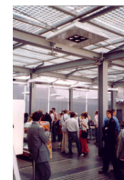
Roof system (TFM)