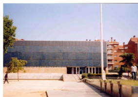
Facade system (TFM)