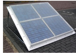
Glazed module (PVTWINS)