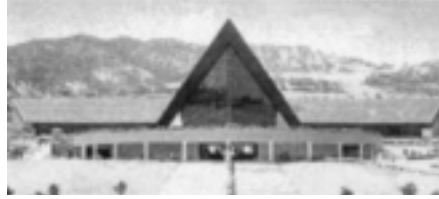
Club Campestre Ecológico Asturiano is one of the largest thermal solar water heating installations in Latin America.

Another effort to promote the development of renewables began in 1997 through the Consultative Council for the Development of Renewable Energies (COFER). COFER is a joint effort between CONAE, in co-ordination with