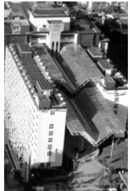
This is a government employee hospital that uses 300 sq m 2 of solar collectors to heat the hospital's water.

In view of the country's positive climatological conditions, solar technologies are applied to buildings, primarily, to solve the problems of warm and warm-wet conditions. The use of solar to heat buildings is less frequent and only applied in cool weather areas in the northern part of the country. Nevertheless, the heating of water for special services, such as swimming pools and household use, are important applications. For example, the "Club Campestre Ecológico Asturiano," a sport center located in the State of Morelos, uses 2,335 m 2 of glazed flat plate collectors and 2,200 m 2 of unglazed flat plate collectors to heat a swimming pool and showers. This application is considered to be one of the largest thermal solar water installations in Mexico.