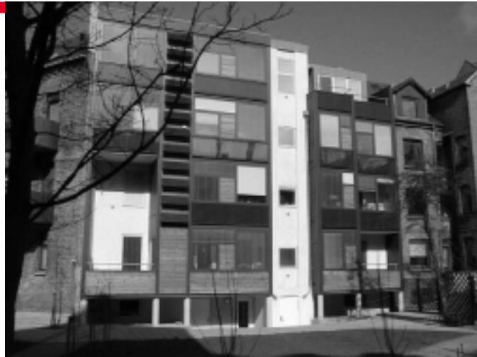
The Yellow House in Aalborg, Denmark was a Task 20 demonstration project. The solar renovations made were the renovation of the building facade using glass with PV-cells, and the installation of solar air collectors for preheating ventilation air, glazed balconies, and solar water collectors on the roof for domestic hot water.

Task experts contributed to a four-fold reduction in the cost of installed solar air systems by working to optimize manufactured collectors, encourage the use of more rational site-built collectors and simplify system configurations.